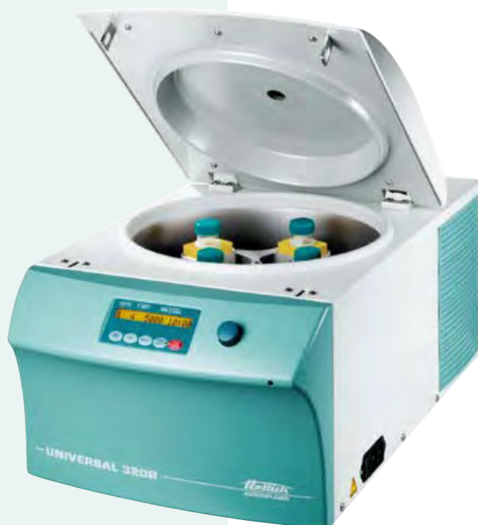
UNIVERSAL 320 R cooled

The display panel and all controls on the UNIVERSAL 320 and 320 R centrifuges have been designed ergonomically. Information on the display is clearly positioned and perfectly legible. During centrifugation, the actual parameter values are indicated. Nine acceleration and braking ramps, or unbraked run-down, can be pre-selected. Ramp 9 always corresponds to the shortest possible run-up or run-down time. The stored parameter combination remains in the memory even after the centrifuge has been switched off. By entering the rotor radius r/mm , the centrifuge calculates and indicates the rotational speed RPM or the relative centrifugal force RCF. The twist knob allows quick and easy entry or changing of the parameters.