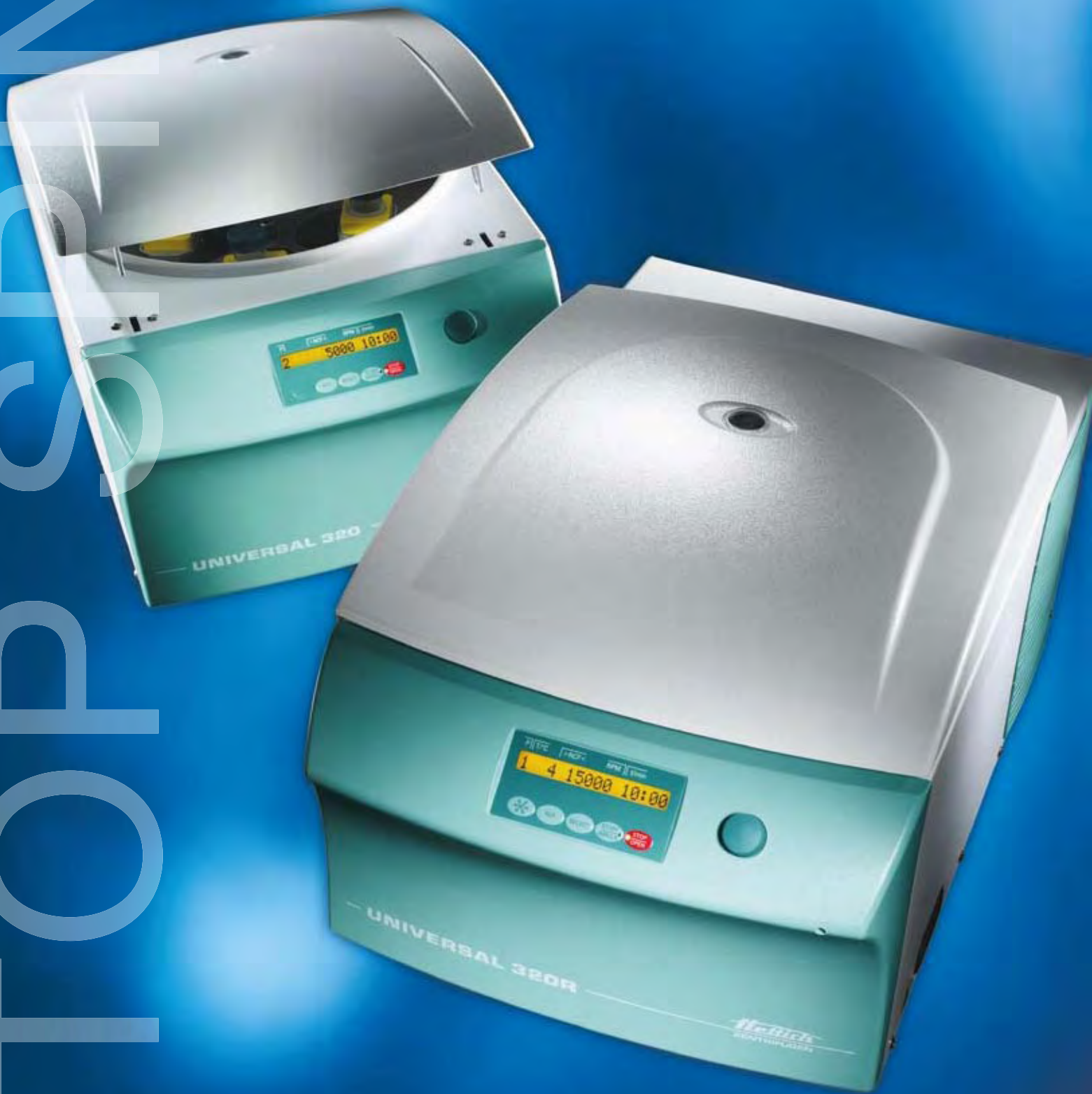
UNIVERSAL 320/320 R Benchtop Centrifuges classic/cooled