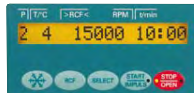
UNIVERSAL 320 R control panel (N Plus control panel)