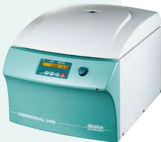
UNIVERSAL 320 classic

There are good reasons why we have called these centrifuges UNIVERSAL. Their excellent performance and comprehensive range of accessories enable them to carry out virtually any centrifuging task. In the low speed range, the UNIVERSAL 320 and 320 R process standard tubes up to a volume of 100 ml, microtitre plates, conical tubes with screw cap, blood collection tubes and cyto accessories. Microlitre tubes can be accelerated to an RCF of 21,382. Centrifuge tubes taking higher volumes (up to 85 ml) also profit from the extraordinary motor power of the UNIVERSAL 320 / 320 R. At an RCF of 9,509, bacteria and yeast sediment quickly and easily.